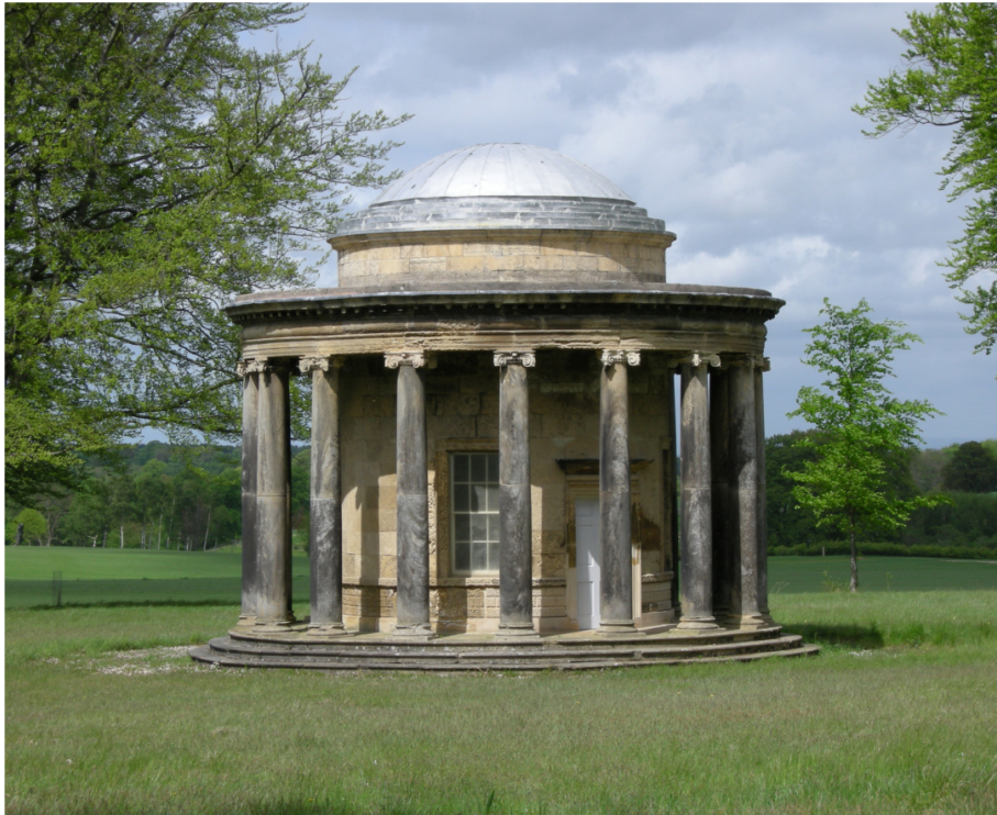
Figure 4: The Round House, Bramham Park.