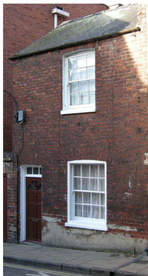
Figure 5: Cumberland street house.