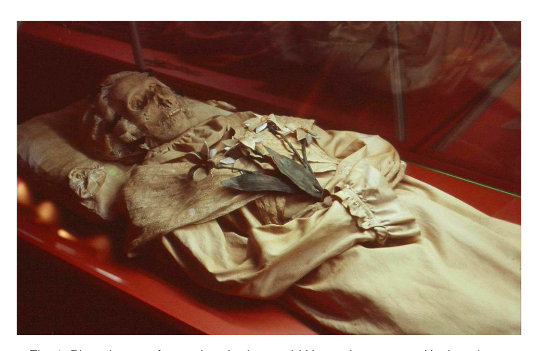
Fig. 1: Photo image of a two hundred year old Hungarian mummy (Archaeology Magazine 2015a).

On 10<sup>th</sup> April 2015, the Archaeology Magazine posted a photo of a Hungarian mummy, indicating that it was a victim of tuberculosis (see fig. 1). At the time of writing, there are over 9,000'likes' and over 1,000'shares'. Nine days later a photo of 'Red Franz', a bog body from Germany, was posted in their Facebook page (see fig. 2).