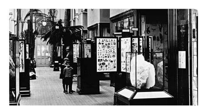
Figure 3. An interior view of the Botany Gallery, The Natural History Museum, London in 1911 (Available at: <u>http://piclib.nhm.ac.uk/results.asp?image=012575</u>).

The central hall of The Natural History Museum in London in 1924 (Figure 2) and the interior view of the Botany Gallery in 1911 (Figure 3) are similar displays to the modern-day PRM. Both of which contain a number of black-framed cases containing natural artefacts. This therefore shows how other museums have changed their image while the Pitt Rivers Museum has remained with the customs of the early 1900s. However, this is not to say that the PRM has not adapted over time. While the PRM does not incorporate 3D technology, digital learning, electronic display, interactivity nor hand-held guides within its physical facility, it does have a very large web presence especially in relation to social media, namely Twitter and Blogger.com. The museum also uses Quick Response (QR) codes which can be scanned using