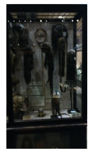
Figure 1. 'Treatment of the Dead': shrunken heads (Tsantas), scalps, and trophies (Image Copyright: I.