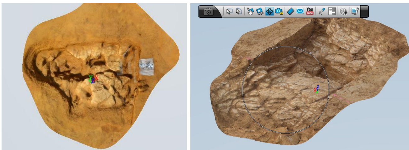
Figure 1 & 2. Two features in which the base is hard to plan due to it being cut into the bedrock.

Many programs allow the creation of Photogrammetric models from photographs, but for this project the one chosen was 123D Catch by Autodesk. The main reason for this choice is the availability and simplicity of the program, which is complemented by good accuracy. Previous unpublished work by the author suggests that 123D Catch provides an error margin of less than 1% (Figure 1), although it is based on smaller objects, while Chandler and Fryer (2011) have achieved reconstructions with less than 0.17% error. Programs like AgiSoft PhotoScan should provide even higher accuracy due to a larger number of points being created in each mesh, but while 123D Catch is freeware, PhotoScan is a commercial product which as such may not be available to all. Ducke, Score and Reeves (2010) suggest an alternative and more accurate approach, yet the process requires a number of programs, some of which are less than user friendly.