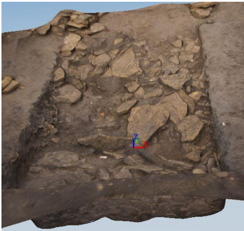
Figure 5. A stone spread, part of a rampart.

Sections can also be successfully recorded using this method, either as part of a larger model of the entire feature or as a separate entity (Figure 4). These models combine section drawing and photography, and by using MeshLab, it is possible to draw lines within the model in order to show the separation between the different contexts, meaning that the interpretation of the excavator, who would have actually experienced the changes of soil first hand, is not lost.