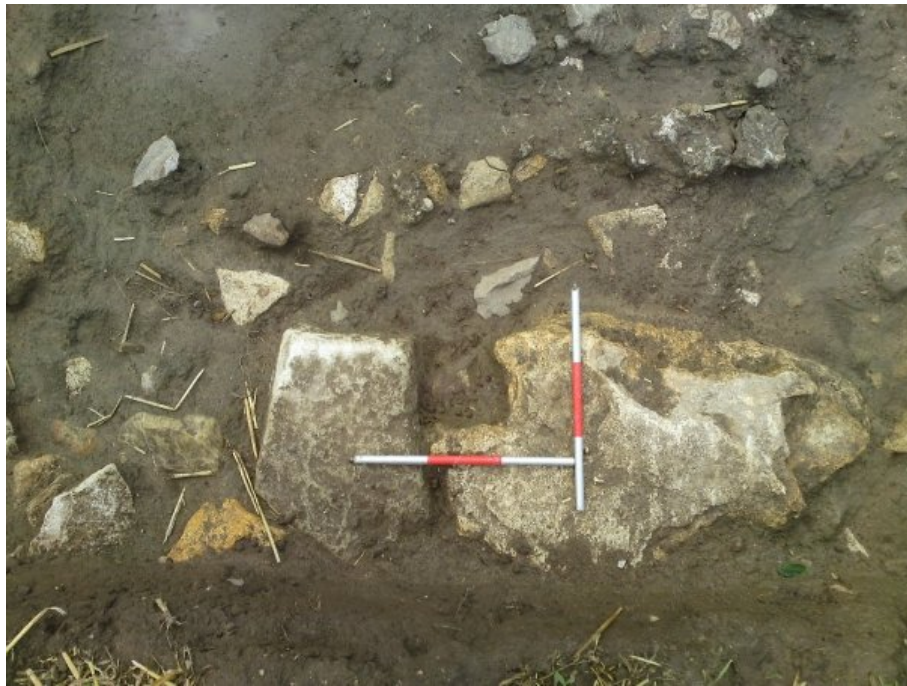
Figure 4 Door lintel stone in test trench B.

Following the 2009 season's discoveries, the team plan to continue working with the local volunteers and community to research Teffont's heritage. One of the most important aspects of the project is its use of multiple methods, and fresh approach to open discussion from all participants regarding methods and interpretation. This allows a training process to take place which has proved immensely rewarding for both project management, students and volunteers. In 2010 fieldwork opportunities are available for 20 University of York students, whether under-graduate or post-graduate, and these will be subsidised substantially by ArcSoc for paid members. To give some idea of the experience available, one of our team members last year, a third year at the time, has provided excerpts from her dig diary.