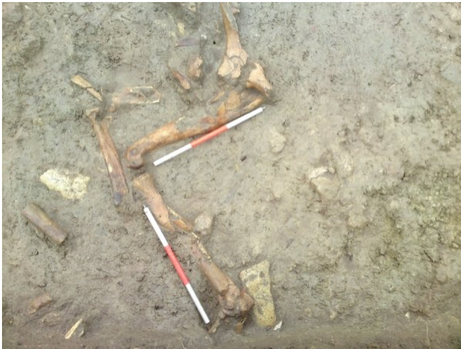
Figure 3 Articulated cow skeleton in NW corner of Test Trench A. (Credit: author).

An aim for the following season will be to fully excavate this trench, and attempt to establish the relationships between the exterior activity areas and the occupation site. The proximity of the site to a probable Romano-British shrine in Upper Holt Wood (Grinsell 1957), on the ridge above the field may indicate a religious aspect to the site. These aspects will be fully elucidate, and the context of the site discussed in the full site report for 2009, currently being completed.