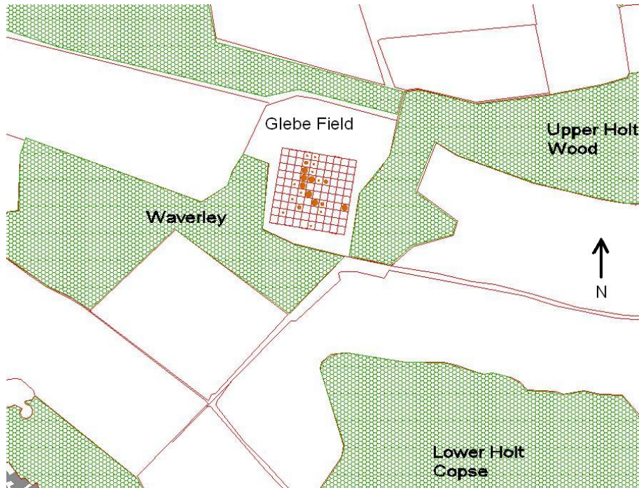
Figure 2 – Distribution of Roman pottery in the Glebe field, illustrating the area field-walked in the context of the research area.

These areas are likely to be areas of domestic activity peripheral to the main occupation, the edge of which was discovered in test trench B.