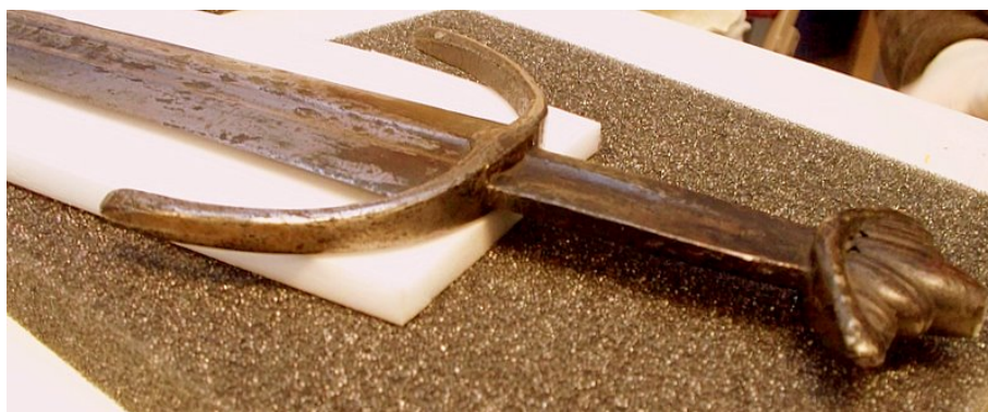
The Cawood Sword.

The final artefact was billed to be the highlight of the talk, the Cawood sword. This unusual weapon features a pommel type dated as Viking around the 9th Century and a guard dated as Medieval around the 12th Century. Experts believe this sword could have belonged to someone on the cutting edge of style, a weapon fashionista if you will. The sword was found in the river Cawood in the 19th Century and appears to be in an amazing state of preservation, although x-rays still need to be conducted to establish the internal weaknesses. This could be due to the low oxygen levels in the river mud, or has been suggested by some, an exceptionally high carbon content making the sword a piece with particular high status and remarkable craftsmanship. Again, tests would need to be carried out to confirm this theory. The sword then passed into private ownership and was acquired by the museum after it was donated in lieu of tax after the owner passed away. The sword is inscribed on both sides, although the meaning is yet unknown with suggestions including a personalised inscription such as a name, a Biblical inscription or a concept or spell similar to those invoked by runes but in a more modern alphabet. Again, more work in this area is hopefully to be carried out in the future.