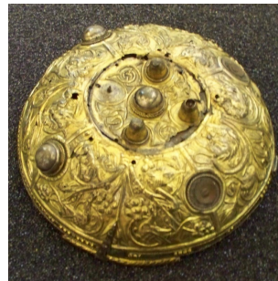
The Ormside Bowl.

The Ormside bowl, an 8th century bowl which had been converted to a drinking vessel late into its life and was buried with a Viking warrior. The bowl is an exceptional artefact made of two pieces riveted together. The outer is gilded silver with vine-work decoration whilst the inside is plain with a blue glass bead surviving with evidence for three others now missing. This was one of the two artefacts not able to be handled, due to its fragile nature.