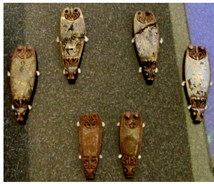
Poppleton strap-ends.

The penultimate artefacts were a collection of 8 complete strap-ends which formed two complete sets of four. Called the Poppleton strap-ends, they were found in a field in Upper Poppleton, near York and are made from silver with Anglo-Scandinavian style decoration. They are referred to as Trewiddle style after a similar hoard found in Trewiddle, Cornwall and feature stylised animals.