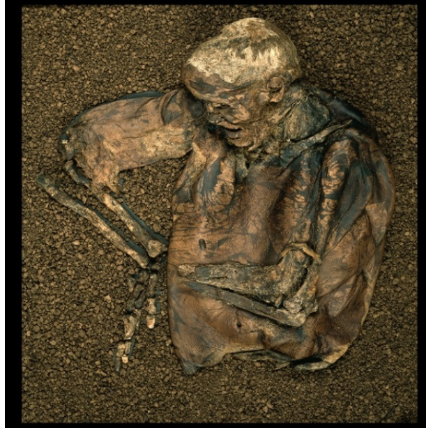
Figure 1. The remains of Lindow Man.

Even though in recent years, Lindow Man has made an appearance back in the North at Manchester Museum (Kirby 2007) and has been displayed at the British Museum for ten years, it was only briefly that he “came home”.