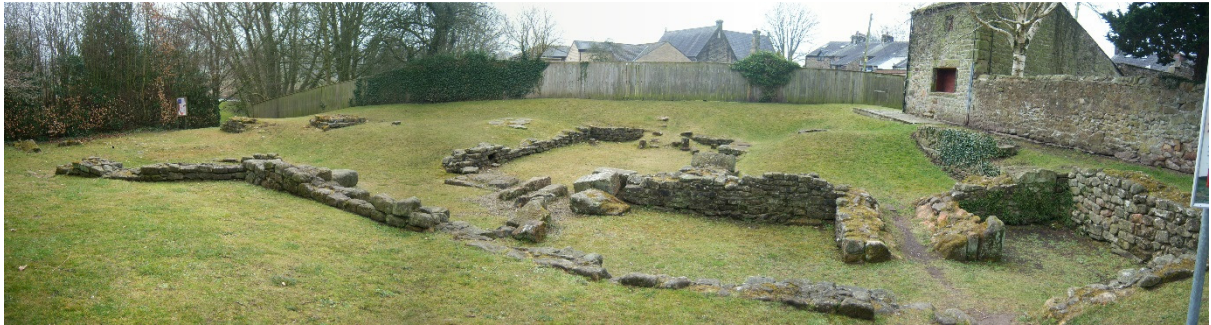
Figure 2. Ribchester Roman Bath house (Image copyright: F. Morrissey).

Another archaeologically significant site in the North-West that is perhaps not as well-known, is that of the Roman fort and settlement at Ribchester, Lancashire. There has long been interest in the archaeology of Ribchester by antiquarians, but only since the 19 th and into the 20 th century have excavations been carried out systematically to gain sufficient records (Ribchester Roman Museum N/A). Some of the features found at the site include the bath house (Figure 2), which was discovered in 1837 in the garden of Dr. Patchett, the main fort complex dated to AD70s, and an extramural settlement (Buxton and Howard-Davis 2000, 7).