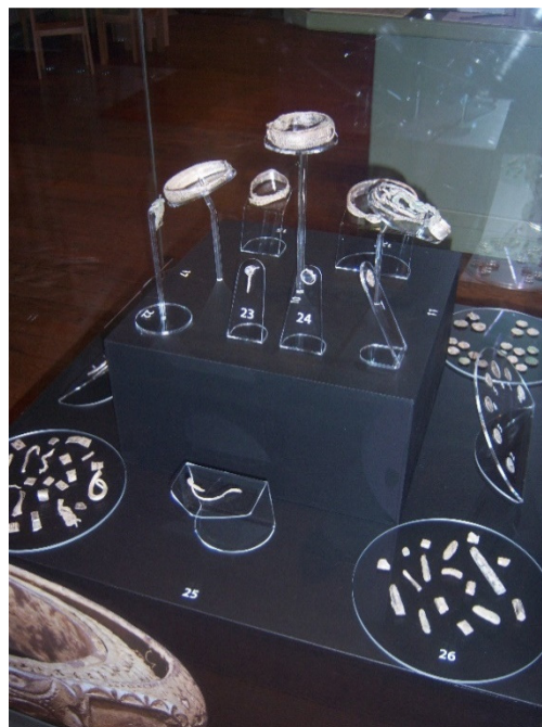
Figure 4. Silverdale Hoard as displayed at Lancaster City Museum.