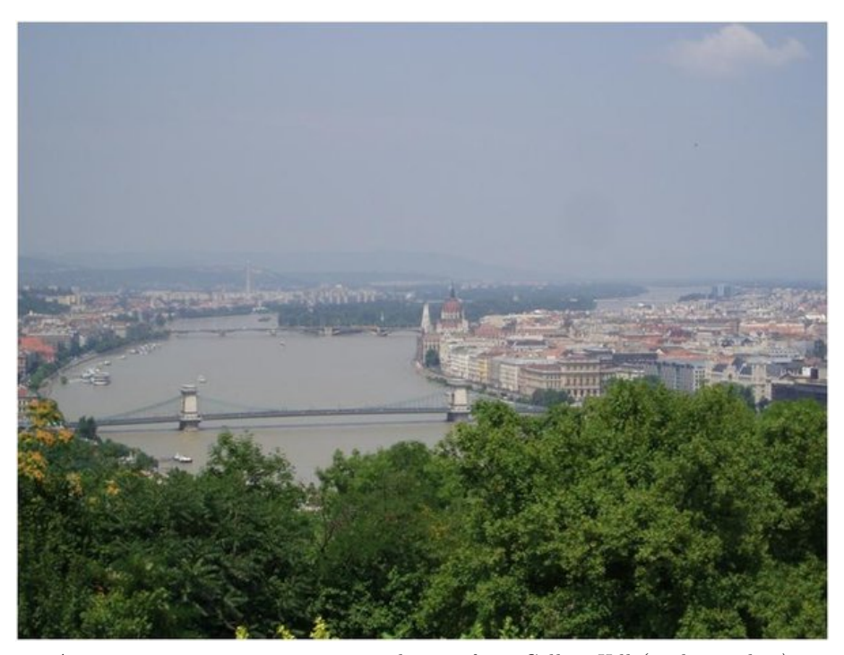
A stunning panoramic view across the city from Gellert Hill.

As I discovered in July, an odd changeover takes place in the capital of Hungary during the summer months—such is the intensity of the heat that locals move out of the city, leaving tourists to take up residence in various parts of the three cities. These three cities – Buda, Obuda and Pest – unified in 1873 to form Budapest following the construction of the iconic Chain Bridge over the River Danube. Although the site of Budapest has been occupied since the arrival of the Celts there in the third and fourth centuries BC, this unification in 1873 is the event which can really be said to have propelled Budapest into world capital status. Each city provided individual style, flair and character, with Pest most notably contributing commercial flair and providing the bulk of this capital, taking up one third of the Budapest I encountered in July.