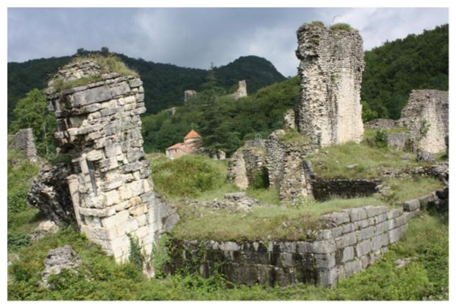
View of Nokalakevi. Forty Martyrs Church surrounded by imposing fortification walls.

The very rich archaeological heritage in Georgia is poorly known and not well documented outside of the country. This scholarly isolation, initiated in the 1930's and continuing until the 1990's, was due to the former Soviet Union and the instability it caused. Partly as a result of this instability and political and ideological pressures, Soviet-era archaeological methods seem outdated by western standards. However AGEN's enthusiasm and encouragement, the implementation of western archaeological methods, combined with western engagement with Georgian archaeology and scholarship, have resulted in nine successful expeditions to Nokalakevi to date. This is despite the present political rumblings and aggressive occupation in 2008 by the Kremlin in which Russian troops entered Nokalakevi on 20th August 2008.