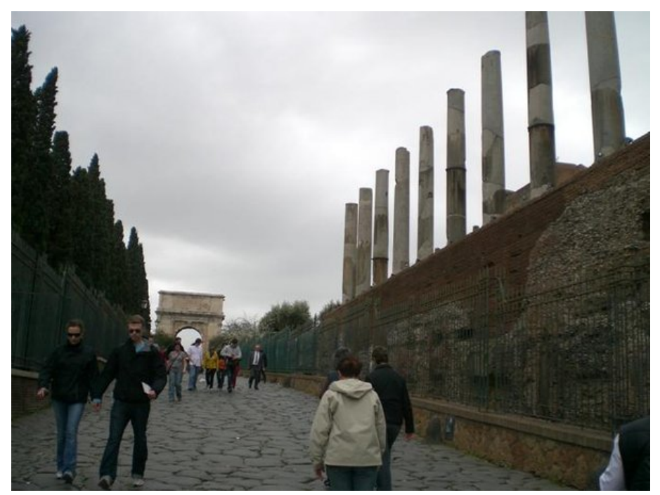
View up the Via Sacra showing the Temple of Roma and Venus (credit: author).

not only used as a temple but also as the storage place for the bronze tablets, on which the laws of the state were inscribed, and as housing for the national treasury (Grant 1970, 81). The social order of the Knights paraded annually in front of the Temple of Castor and Pollux and balloting for official votes was held here from 145BC (Grant 1970, 86). The House of the Vestal Virgins also had a dual purpose as it acted as a safe deposit for public and private documents (Grant 1970, 61).