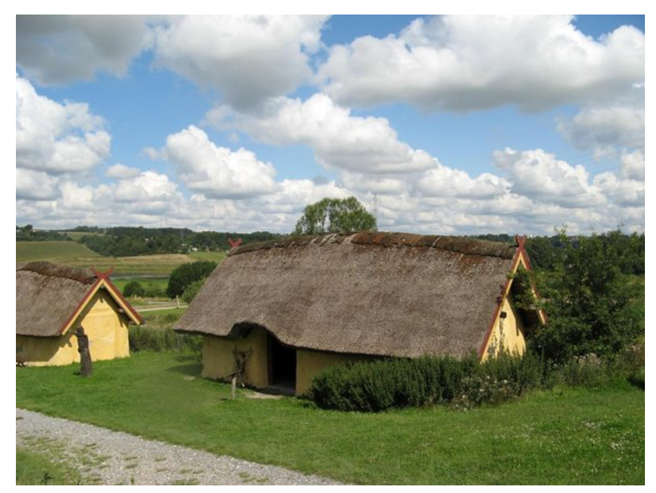
Reconstruction of a Viking Age Farm (credit: author).

The course itself could be divided into two main components: a series of lectures on various topics relevant to the Viking age; and two days of coach excursions to Viking sites on the Jutland peninsula, together with an afternoon devoted to a tour of Moesgård and Aarhus museums, and a guided walk around Viking Aarhus.