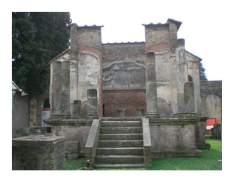
The Temple of Isis, Pompeii.

In Ostia there were most notably two groups of temples separate from the forum, the Republican temples and the temples on the Campus of the Magna Mater. The Campus of the Magna Mater is right on the city boundaries. The argument for political unpopularity cannot really be made here as it is a large site. If it was politically unpopular then surely it would not have been powerful enough to own such a large amount of land. It is more likely that the cult desired some level of privacy, despite being a 'public' cult. The Temple of the Magna Mater is set away from the rest of the buildings, heightening the sense that this cult was a private, yet public one. Religion also provided means for