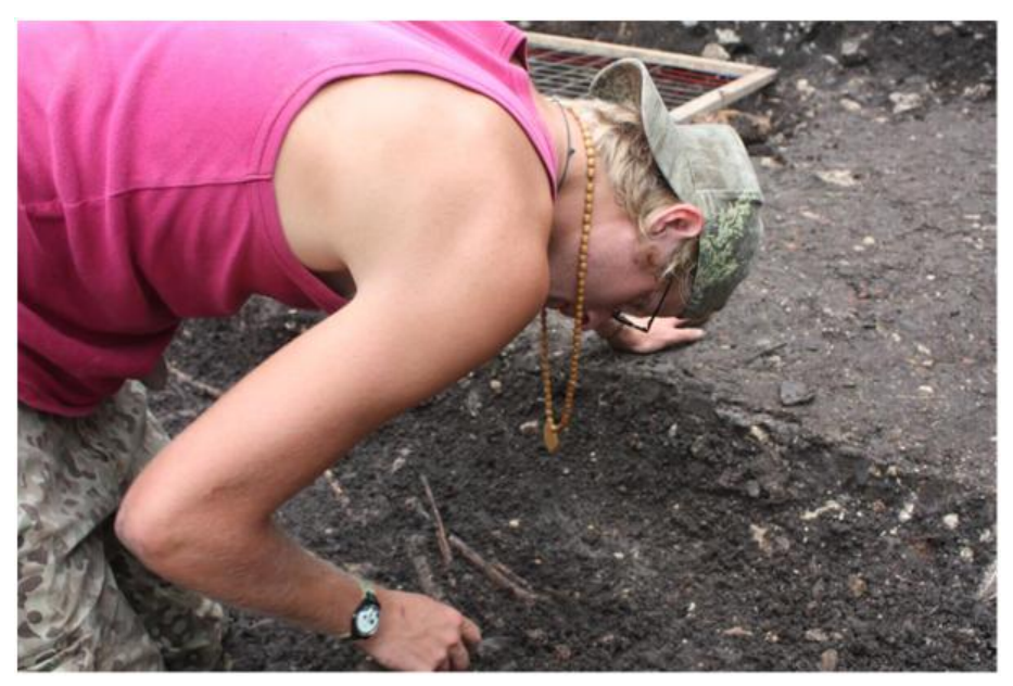
The author excavating a Byzantium inhumation in the cemetery of Trench B, July 2009 (photograph by Ano Tvaradze).

Trench 'A' on the other hand was excavated further though work ceased due to bad weather around the third week of the four week season. However excavation yielded three further inhumations within the Hellenistic cultural deposits and further evidence of wall foundations and cobbled surfaces within destruction horizons. Further work undertaken was a complete GPS survey of the citadel and locale carried out by Dr Paul Everill.