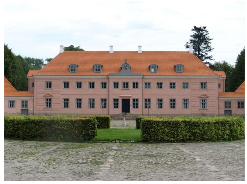
Moesgård Manor.

Arhus is a city on the East Jutland coast of Denmark, and is, I believe, the second largest city in Denmark after Copenhagen, however by British standards it is still quite small with a population of some 300, 000 people. Much of the university is situated within the city; however the archaeology department is located in a pleasant coastal wooded area some kilometers outside the city itself at Moesgård. This is a historic manor house which in addition to the archaeology department is also the location of a museum, conservation labs and some reconstructed Viking buildings. The museum is well worth a visit, and has displays covering prehistoric through to the Viking period, of particular note is the Graubolle man display, which although not Viking may be familiar to those who have studied bog bodies.