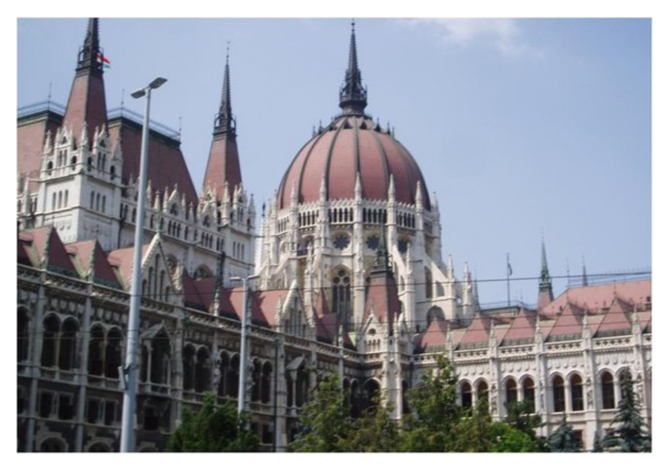
The second largest Houses of Parliment in the world! (credit: author).

the heart of Budapest is an excellent example of this: its geometric designs and stunning attention to detail combined with its sheer scale and splendour didn't fail to astound me. The synagogue is not the only monument of architectural genius to astound the tourist however, with the Houses of Parliament towering by the banks of the river. Their sprawling, vast intricacy took my breath away and even from far away the eye is drawn towards them. Their splendour is fitting for the second largest Houses of Parliament in the world, the largest being our own Houses of Parliament in Westminster.