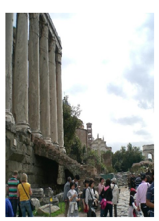
The view up the Via Sacra showing the Temple of Antinous Pius and Faustina and the Temple of Romulus.

The division of space within the temple reflects that of private houses. Both have public and private areas, the latter being only accessible by certain people. Private individuals could do things like commission temples or altars for public use in order to display their wealth and piety (Cooley and Cooley 2004: 31). The evidence does also suggest a blur between the public and private divide, the most notable example being the Shrine of the