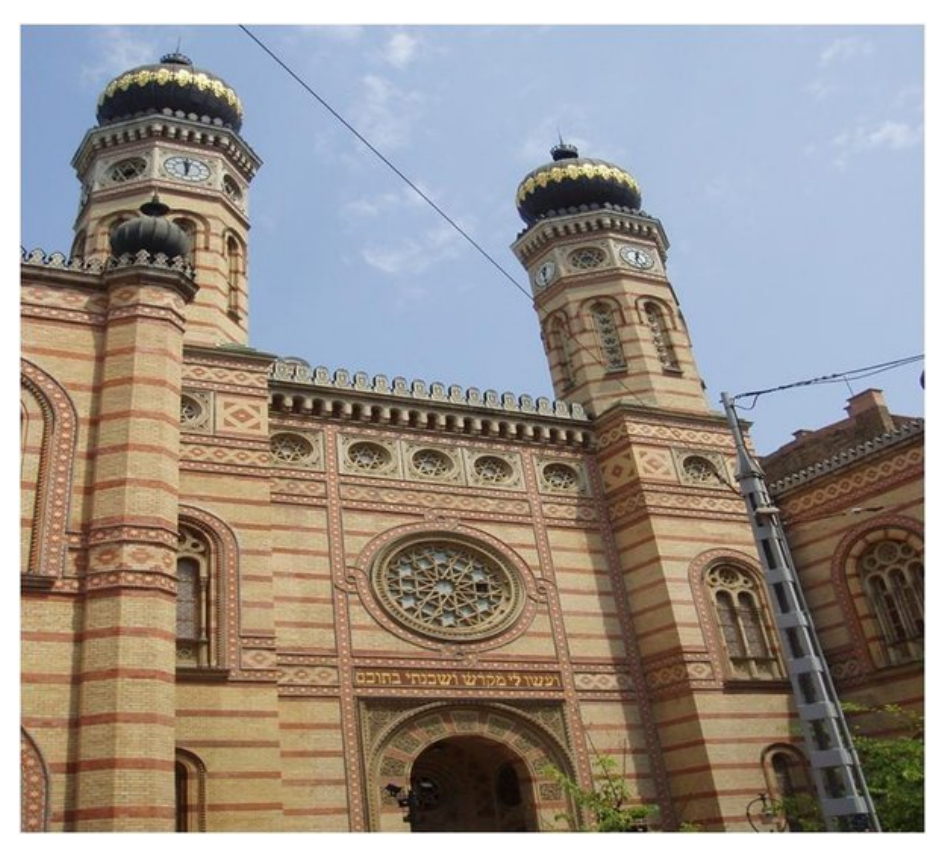
Intricate geomentric designs of the Jewish Synagogue (credit: author).

within the city: the embankments of the River Danube, the Castle District and the Andrassy ut.