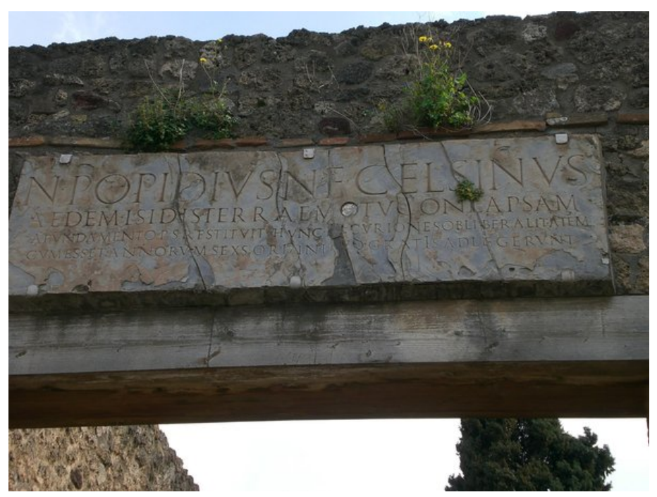
Dedicatory inscription of the Temple of Isis, Pompeii.