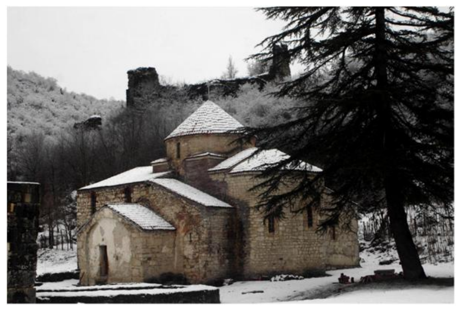
Forty Martyrs Church (6th century AD), winter 2008

looting of the expedition's equipment. On a more positive note the continued support and funding from both the AGEN and the numerous volunteers who have populated in the site in recent years has led to a vast improvement in the 'dig house' which has been modernised. The 'dig house' is now a suitable residence for the archaeologists as well as acting as a location for post-excavation work and a field laboratory for several archaeological sites in western Georgia. The well equipped kitchen enables all members of the excavation team to be fed with this service being provided by local women employed by AGEN (Colvin 2008).