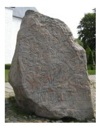
Rune Stone of Jelling.

Unfortunately, at least from my point of view, the course is part of the assessment for many of the Scandinavian students, and consequently finishes with a 4 hour exam, which is taken by all attendees including those who don't count it towards our own degrees. In the end taking the exam was not too great a hardship and one could be quite relaxed, and regard a pass as a useful addition to the CV.