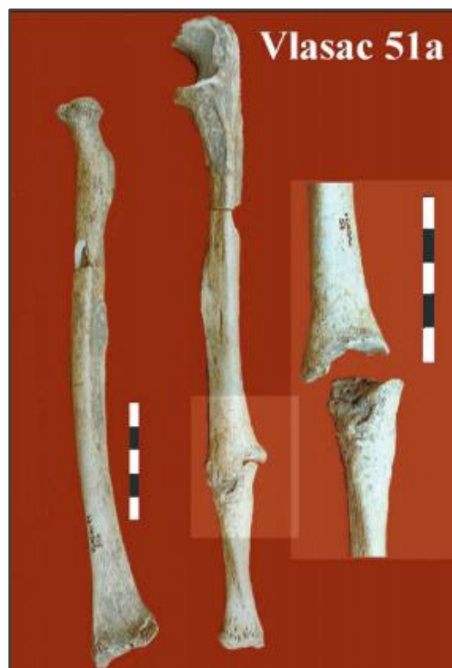
Figure 2: The possible parry fracture from Vlasac, right radius and ulna shown. After: Roksandic, M. (2006). Violence in the Mesolithic. Documenta Praehistorica XXXIII, Oddelek za arheologijo. Slovenia: Filozosofska fakulteta, University of Ljubljana. [Online] Available at: http://arheologija.ff.uni-lj.si/documenta/pdf33/roksandic33.pdf [Accessed 7 March 2016].

Living bone fractures in a noticeably different way to dry bone (Knüsel 2005, 51-4), and ante-mortem injuries will show signs of healing if the wound survived for more than two weeks (Roksandic 2004a, 54). Thus ante- and post-mortem injuries are relatively easy to differentiate. However, determining whether perimortem fractures are due to fatal injury or damage after death, such as from ritual mortuary practices, is extremely difficult. Bone takes time to dry out, and can retain green, plastic qualities for up to two months after death (Roksandic 2004a, 54). Finally, deciding whether this skeletal trauma is accidental or due to human violence can verge on impossible (Roksandic 2004b, 4). As there is no universal indicator of violence, we must rely on 'best judgement' based on the evidence of the bones, the context and cross-cultural knowledge (Rogers 2004; Knüsel 2005, 53).