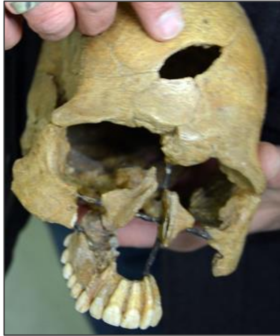
Figure 3: A reconstructed skull recovered from Ofnet Cave, showing distinctly shaped bludgeon wound. (Image: Ludwig-Maximilians-Universität, München).