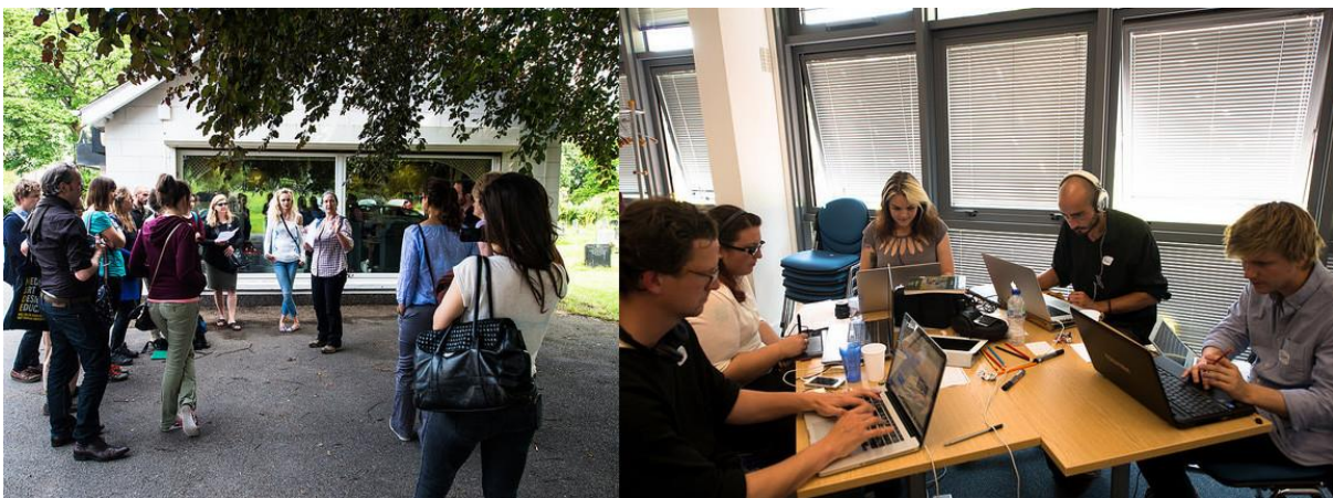
Figure 2. Left : The Heritage Jam at York Cemetery. Right: 'The Inventors' working on the Voices Recognition app prototype.

On the 11 th July I was able to take part in the Heritage Jam, a first for heritage and visualisation. This was an invaluable experience, enabling me to meet professionals and others with similar interests. It aimed to bring people together, working on the concept of burial. The result of the Jam is an online gallery of work from teams and individuals, showcasing many different perceptions of burial and archaeology; this can be accessed at http://www.heritagejam.org/jam-gallery/ . My working group 'The Inventors' drew inspiration from York cemetery; after discussing the idea of paths through the cemetery and hidden stories, 'Voices Recognition' emerged - an app that projects simultaneously the voices of those individuals buried. Other members of the team talk about their experience and give more detail about the app in their blog for the Day of Archaeology, available via http://www.dayofarchaeology.com/archaeology-hack-a-thon-the-heritage-jam-cemeteries-audioscapes/ . The jam not only resulted in varied and stimulating visualisations, but also promoted the importance of visualisation and art within archaeological practice and digital heritage.