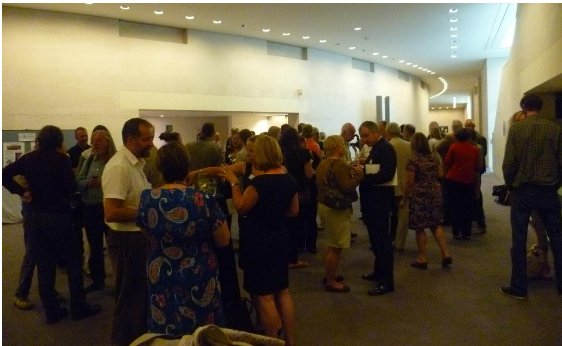
Figure 1. The British Archaeology Awards drinks reception at the British Museum.