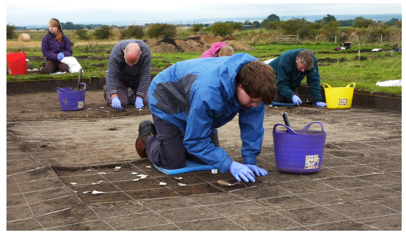
Sampling soil for chemical analyses at Flixton Island this summer

Thank you, yes it's fantastic! It basically funds a group of scientists to do further cutting-edge scientific research on finds and to do three or four more seasons of excavation. We have nearly twenty specialists, based both here in York and elsewhere who are leading experts in the country. So the money goes towards those people working on the Project and also the costs of doing scientific analyses.