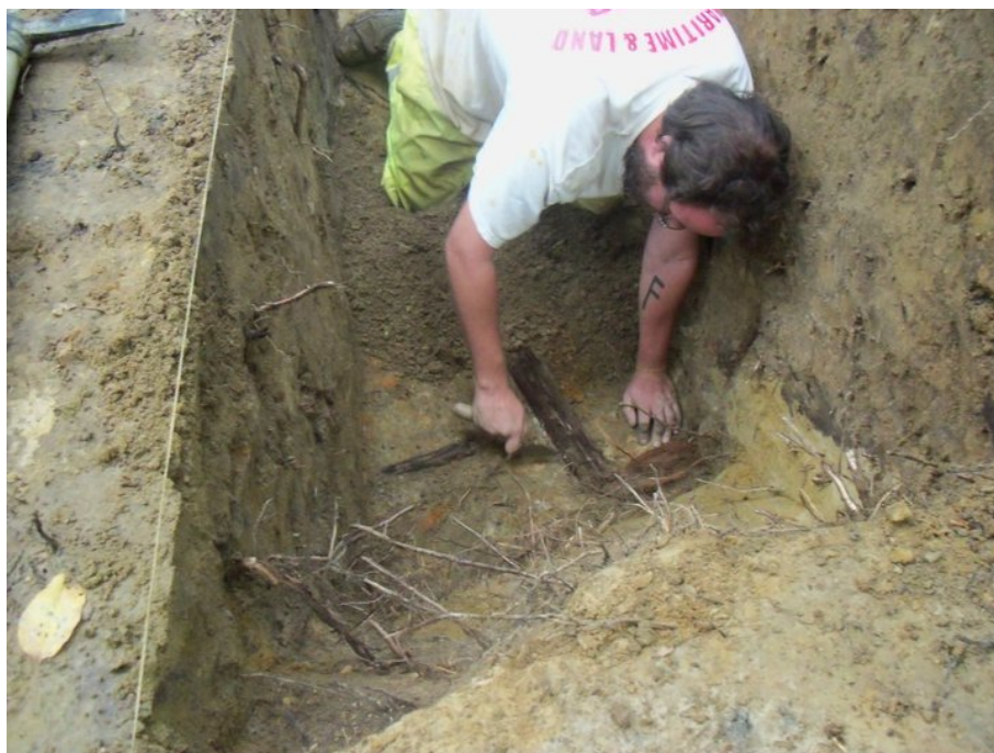
Figure 1 – Author discovering wooden trench boarding, Ypres 2010

Another development during this time was the burgeoning collector's field. Military objects taken from the old battlefields quickly became collector items and were surreptitiously gathered to feed this growing demand. Human remains that would be uncovered were quickly reburied with no ceremony or attempt to rename. In France and Belgium the local archaeological authorities did not recognise the battlefields as worthy of archaeological investigation except in very rare cases, such as the TGV line that ran across the Great War battlefields to Paris. By the 1980s local French and Belgian enthusiasts along with a few British counterparts began amateur attempts at archaeological excavations on the Western Front. These groups took their work seriously, even if it had little academic merit, as can be seen by the publication of Battlefield Archaeology by John Laffin in 1987.