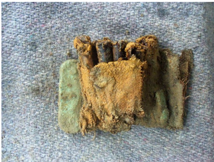
Figure 2 – '08 webbing with cartridges attached, discovered by author, Ypres 2010

By the end of the 1990s, Belgian battlefield archaeology had stalled with the negative publicity of the Diggers' activities in the British press. A solution was needed and in 2003 the Department of First World War Archaeology was inaugurated as part of the wider Institute of Archaeological Heritage (IAP). This development went hand in hand with the A19 project, a proposed road scheme that ran across old battlefields outside Ypres. This scheme was subsequently stopped due to the sensitive nature of the ground which the road ran over, and was only possible through the work of the Department.