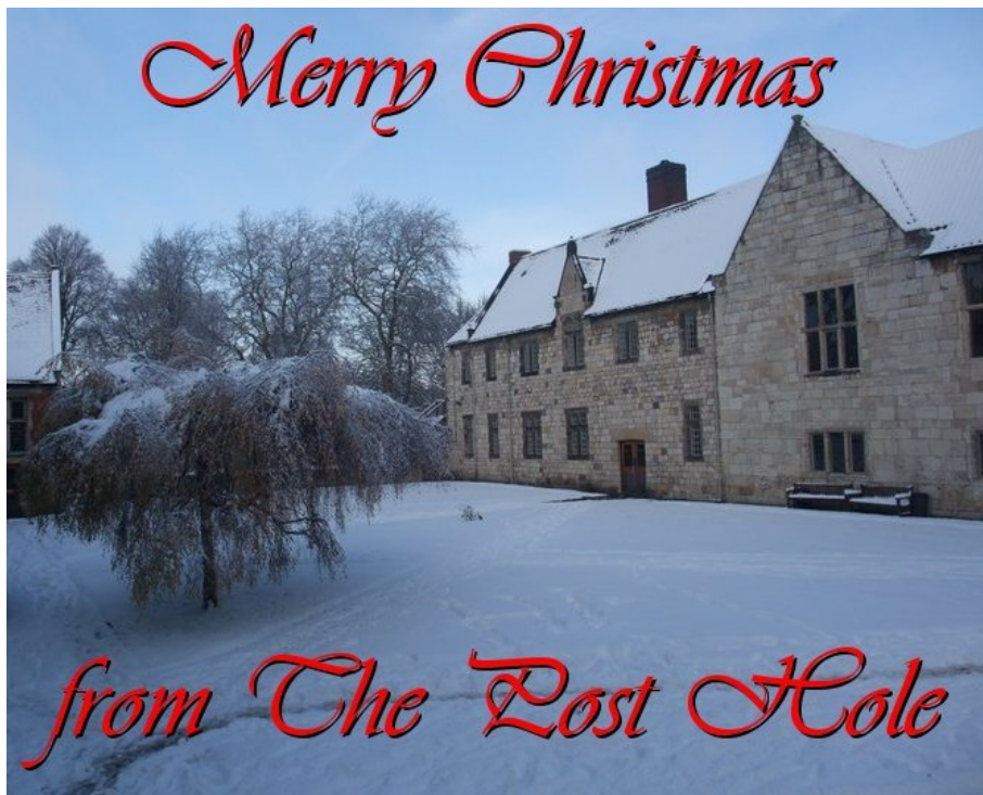
Figure 1 – Merry Christmas from The Post Hole