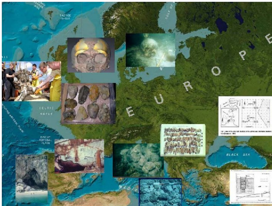
Figure 1 – Map of finds around European coasts

These are just some of the many examples of potentially exciting lowland activity, and these areas exist around every continent, forming large Palaeolithic fertile plains and even land-bridges. Beringia is a famous land-bridge that connected Alaska with Siberia during the Palaeolithic. Sunda was an extended land region connecting many of the Indonesian Islands, and Sahul was a large continent that connected Australia to New Guinea.