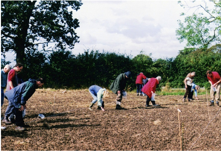
Figure 2. Field-walking 2009.

one of mainly sands and gravels and the rest of clays and silts. None of these fields show any crop-marks other than ridge-and-furrow, now ploughed out.