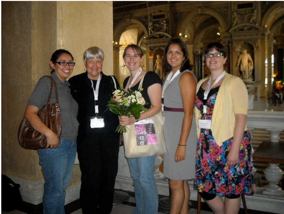
Figure 1. Author with conference participants.

Christina Cartaciano ( mailto:christina.cartaciano@gmail.com )