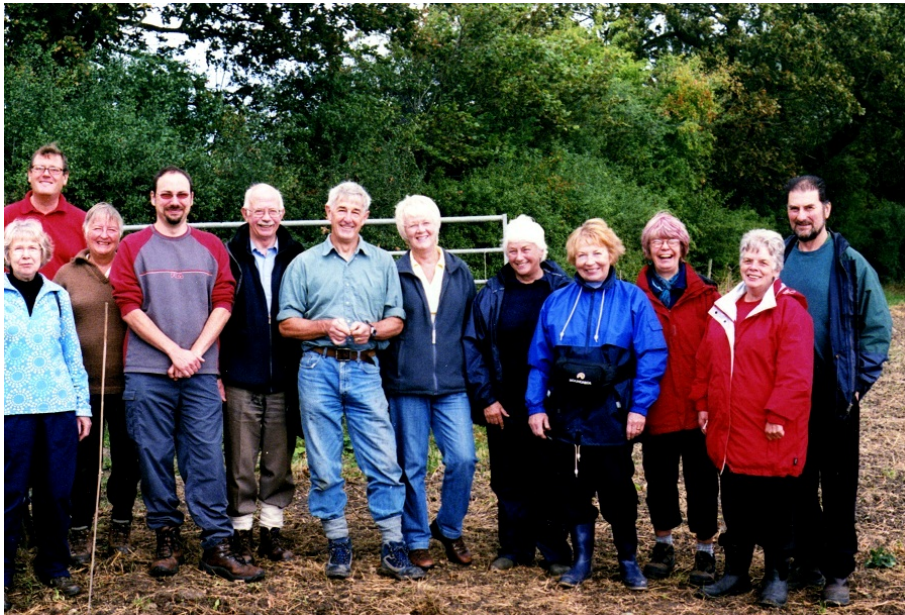
Figure 1. Field-walking team 2009.

The village name derives from an Anglian settlement of the 10th century according to the British Placenames Society and is mentioned in the Domesday Book as having a castle. It is my belief that the castle was built to protect the ferry crossing of the River Derwent much as Malton Castle does. The ferry is mentioned as early as 12th century and it is likely to have existed before that. The Derwent is the County boundary between North and East Yorkshire, although, North Duffield has been in the East Riding for most of its existence prior to the boundary changes of 1974.