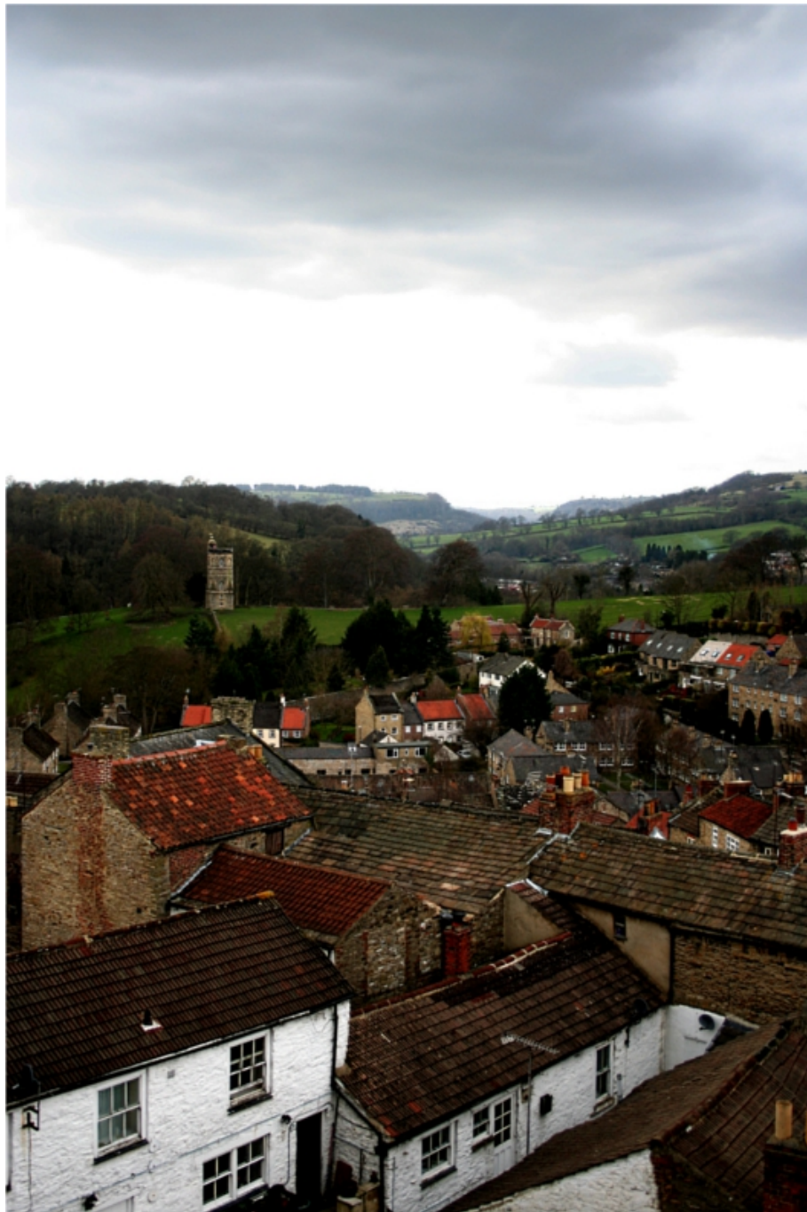
Figure 7. The view from the castle: Over Richmond and up Swaledale.