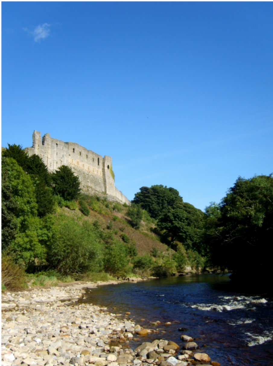
Figure 1. Southern Hill and River Swale