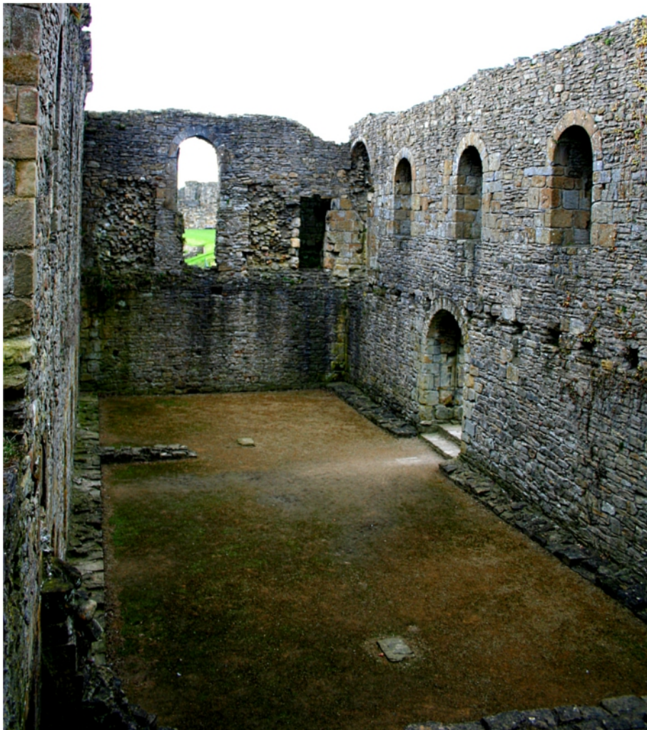
Figure 3. Scolland's Hall – Showing holes for the beams to support the first floor and large arched Norman windows

The Keep, as previously mentioned, was a 12th century addition to the older gatehouse with walls 11ft thick towering 100ft above the town. It consists of three floors; the basement, a lobby and some chambers on the first floor, and a great hall on the second. There is evidence to suggest that there could have been another floor above this as a few beam holes, possibly for beams, remain along one wall. The gabled roof of this top floor would still have been well below the battlements, which could be accessed through stairways within the walls themselves.