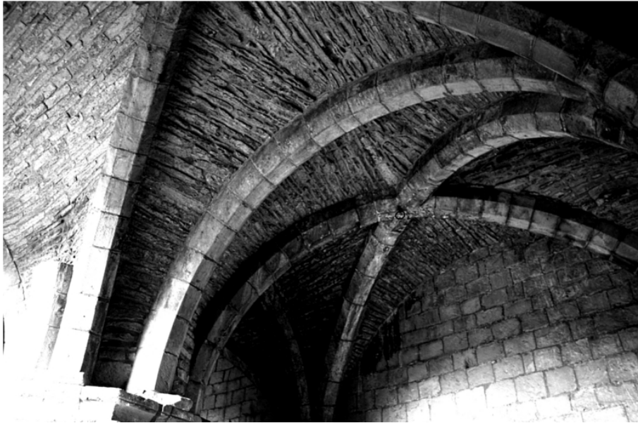
Figure 4. Vaulted ceiling in the basement

protection from fire, help support the rest of the keep and to help keep food cool. Around 1330, a ribbed vaulted roof, which can be seen in Fig. 4, was also added to the basement – an interesting sight for today’s tourists who can once more gain entrance through the unblocked basement arch.