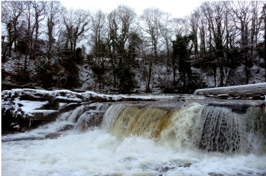
Figure 6. Richmond Fosse, right below the castle.

It was at this time that tourism became an important factor and the continuing popularity of the King’s Head hotel is testament to this. With the newfound local and national wealth from trading abroad tourism became more popular and the historic features of Richmond, situated so close to one of the most beautiful areas in the country, made it a very desirable destination. One notable visitor to Richmond was the famous landscape painter William Turner (anon. 2004, n/a), drawn by the romantic ruins of the castle and the river with its beautiful waterfalls (Fig. 6). His paintings of Richmond only served to further enhance its popularity as a tourist destination over the following centuries.